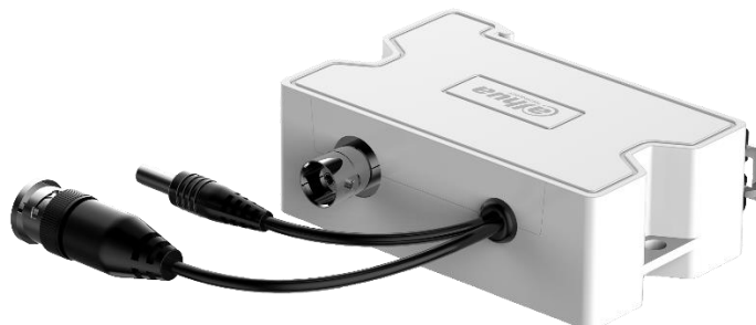
DH-PFM811-C PD End (Power device)