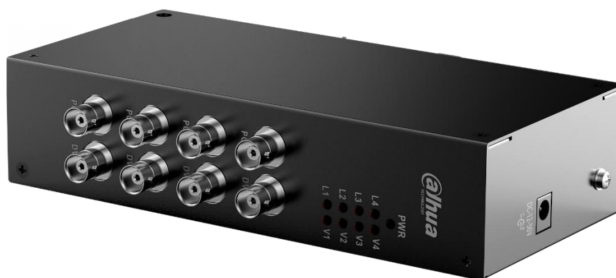
DH-PFM811-4CH PSE End (Power sourcing equipment)