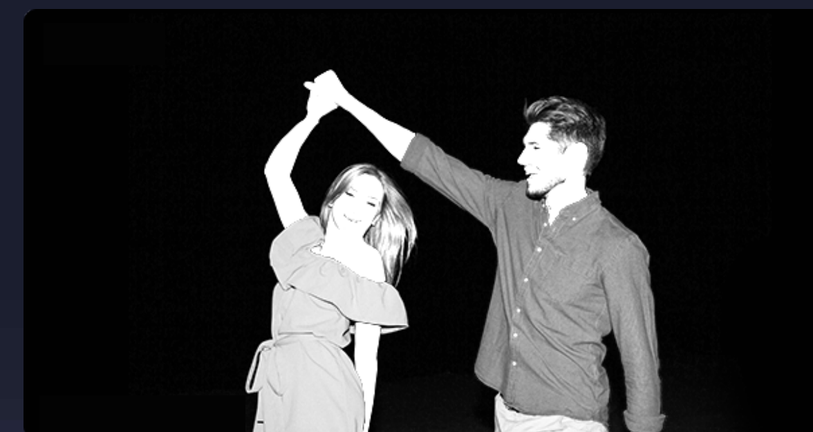
Without PQ Technology