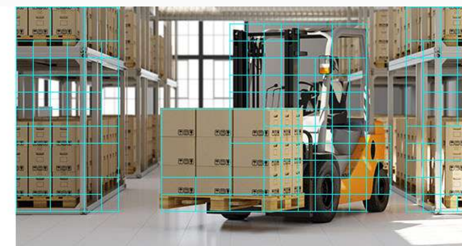
H.265 (Upgraded Video Compression)