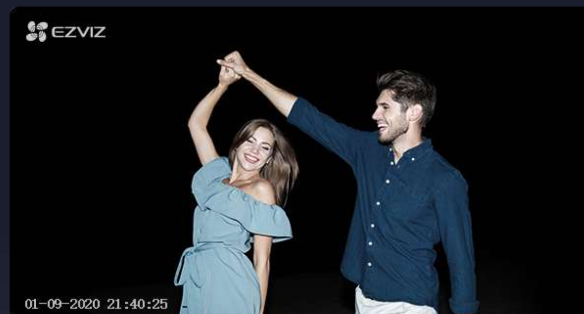
With PQ Technology

The C3N is powered by advanced PQ technology that is based on intelligent sensing of the actual environment. When people approach, it automatically adjusts the image brightness to avoid overexposure. You see much more detail than the video from conventional systems.