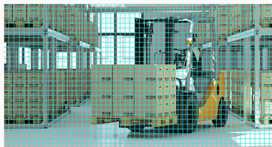
H.264 (Mainstream Video Compression)

The camera features the advanced H.265 video compression technology, achieving better video quality with only half the bandwidth and half the storage space of the previous H.264 video compression standard.