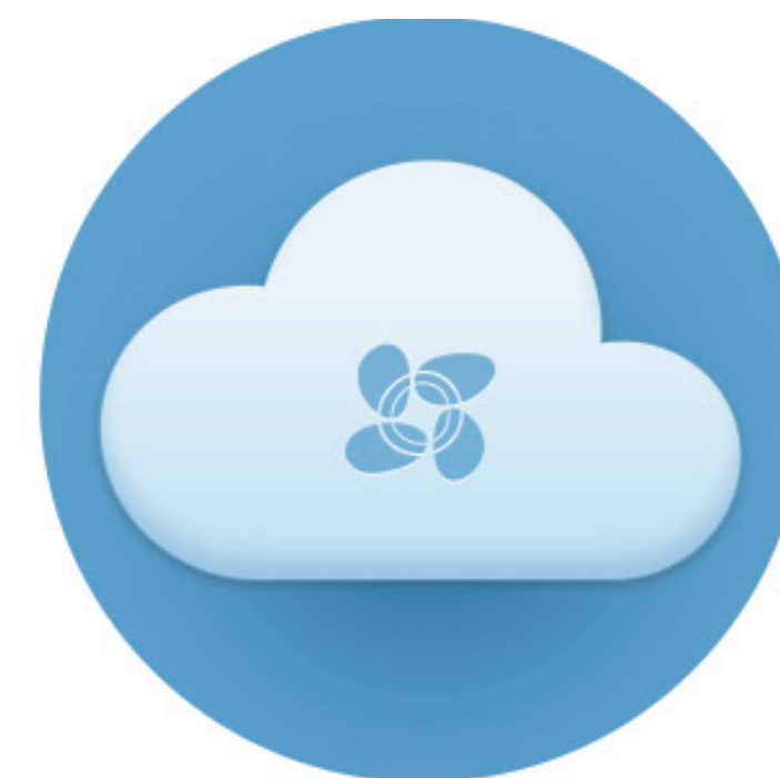
Encrypted Cloud Storage