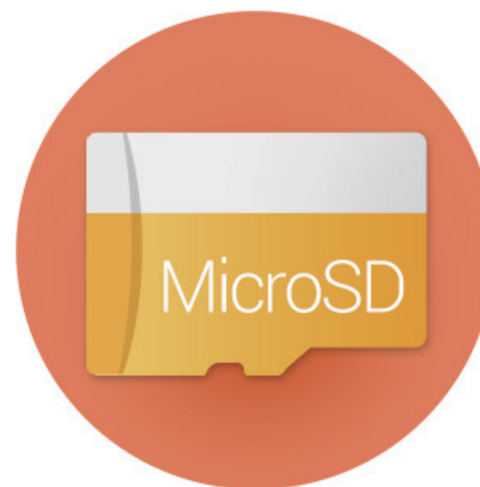
Supports MicroSD Card

Save your recordings with flexible and secured solutions. The DB1 comes with a built-in MicroSD card slot that can store up to 128 GB of recorded footage. You can also save your images to EZVIZ Cloud for additional back-up. (The EZVIZ CloudPlay is only available in the US, UK and Europe)