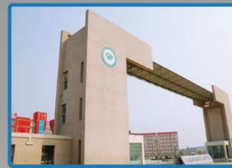
Networked Security: School