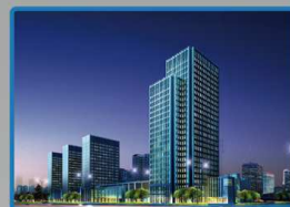
Networked Security: Building