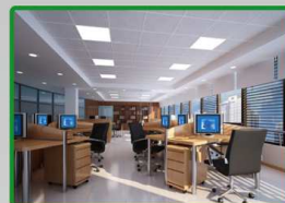
Time Attendance: Office