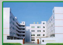
Time Attendance: Factory