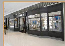
Standalone Access control: Shop