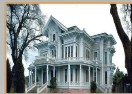
Standalone Access control: House