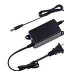
DC12V/2A Power Adapter