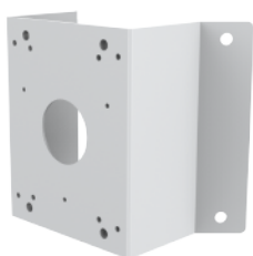
A35 CORNER MOUNT